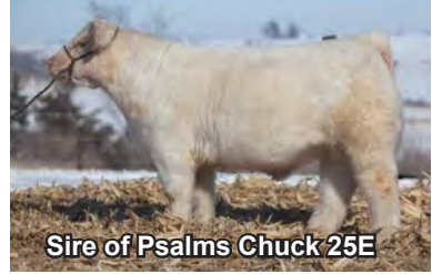
Sire of Psalms Chuck 25E

Psalms Chuck is the first purebred we've released from his dam; the quality of her calves are so high we retained all other purebreds for our breeding program. He has been a standout since birth; easy on the eyes, chunky from the start, and friendly to boot! His sire, Ghost Rider has produced numerous champions including most recently the 2021 Grand Champion Steer at the Illinois Beef Expo & Grand Champion Market Beef at the Weld County Fair (CO) that sold for $12k. Buy him now or compete against him later.