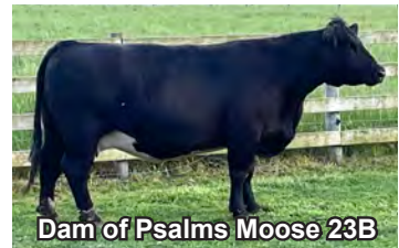
Dam of Psalms Moose 23B

Psalms Moose is a muscular, sound showstopper.