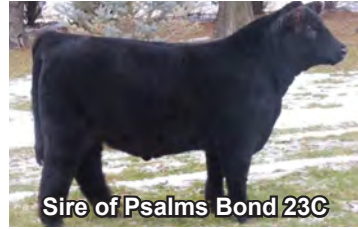
Sire of Psalms Bond 23C

Psalms Bond has a royal pedigree and the foundation for greatness. Prominently, he features exceptional extension through his neck, maintains hair even in heat, and that is all in a sound package. Dam is a maternal sibling to the 2013 and 2014 Champion Shorthorn Females at Jr Nationals. Grand dam is a full sib to the 2003 Supreme Champion at NAILE. Sired by the high selling Shorthorn Plus bull (son of Bellringer) at the Iowa Royal sale in 2021.